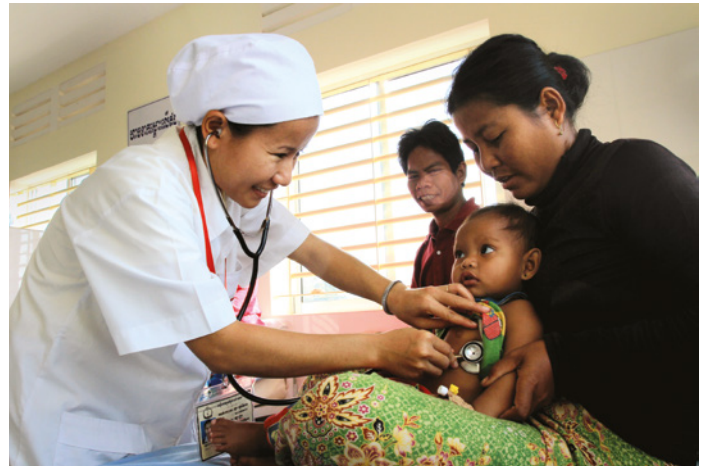
Clinic at Makara hospital in Preah Vihear, Cambodia.